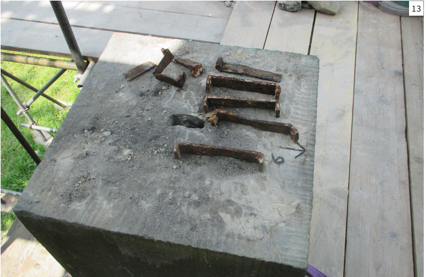
Figure 13 Corroded cramps at Waterloo Memorial, Billinge, Merseyside.