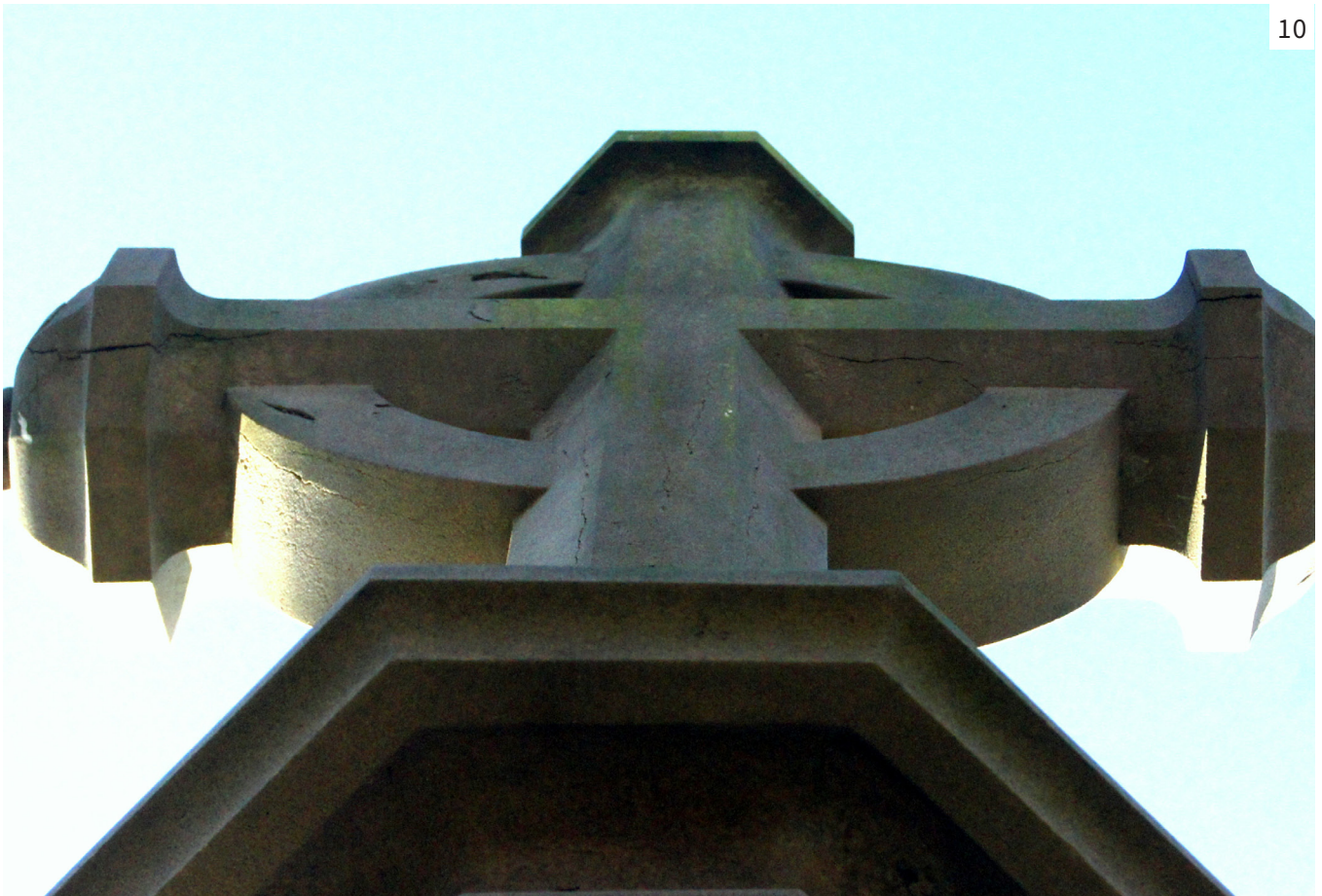
Figure 10 Cracking beyond fingertip reach recorded by telephoto lens, Southborough War Memorial, Kent.