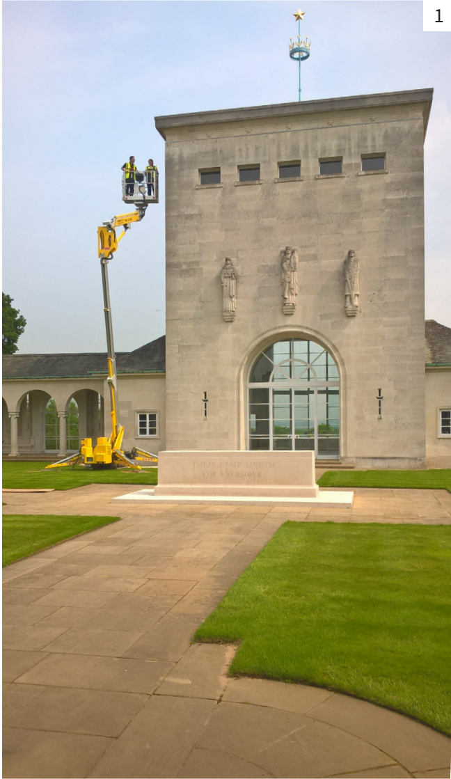
Figure 1 Access platform for inspection, Runnymede Memorial, which is in the care of the Commonwealth War Graves Commission.