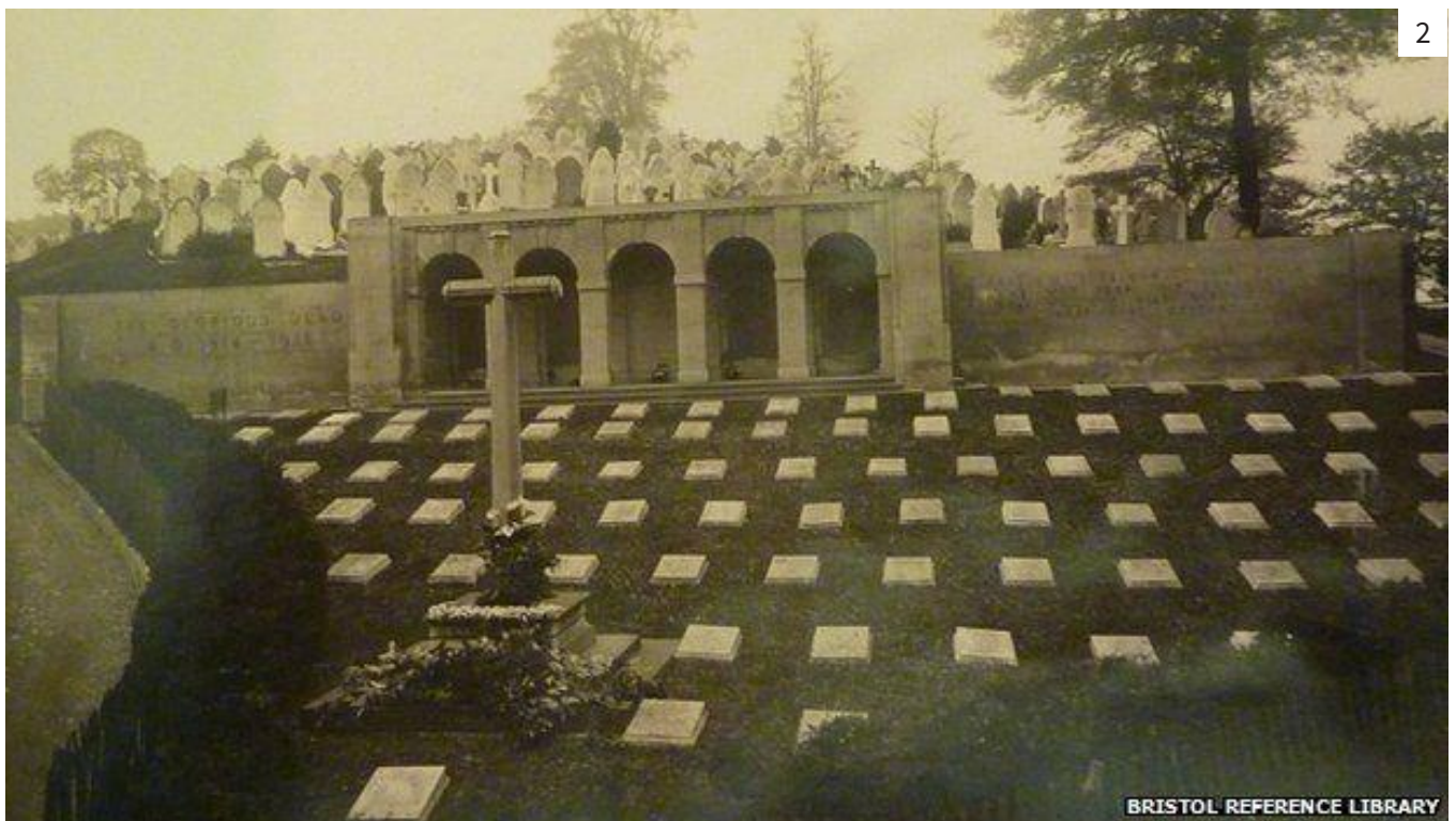
Figure 2 Record photograph of Arnos Vale war memorial.

There is a range of online resources for research listed at the end of this document.