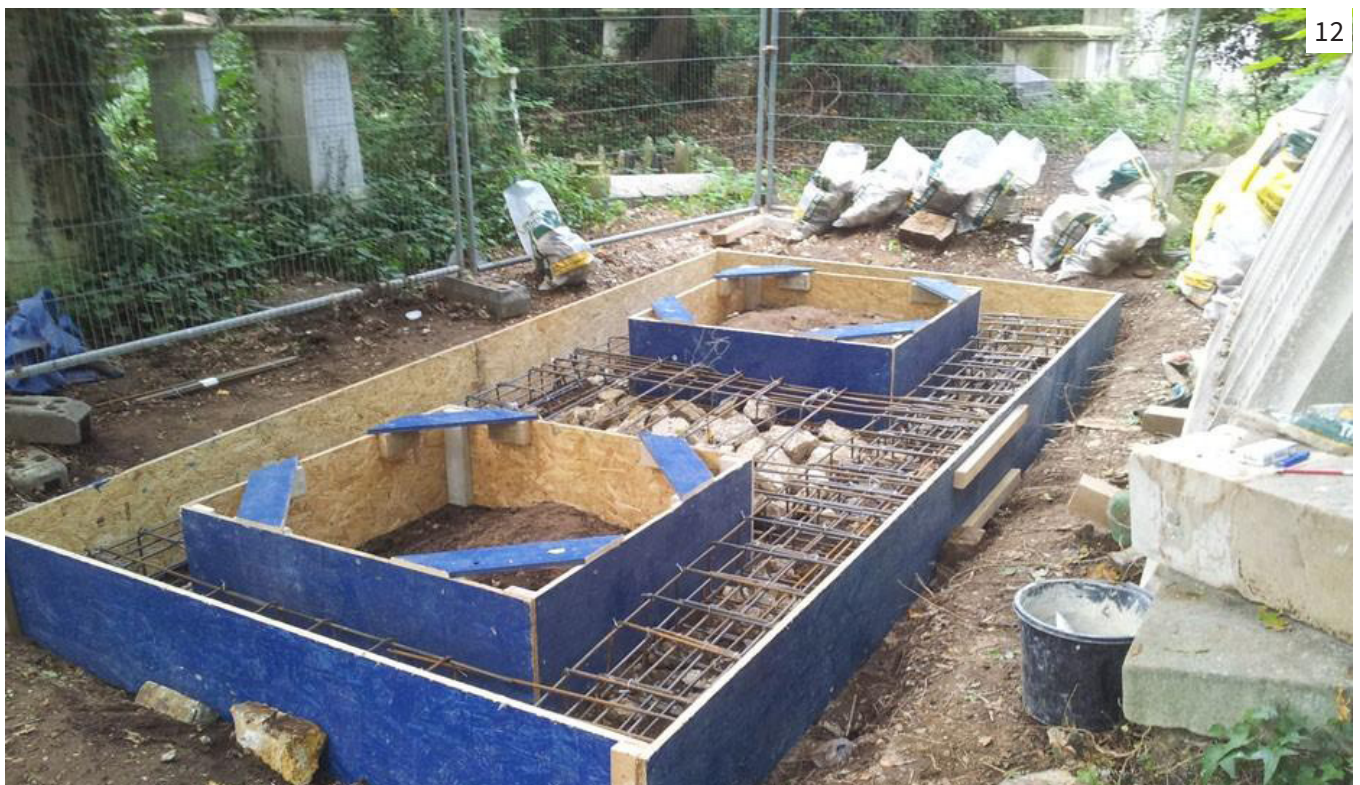
Figure 12 Shuttering and reinforcement in preparation for laying of new foundations, Civilian War Memorial, Stoke Newington.