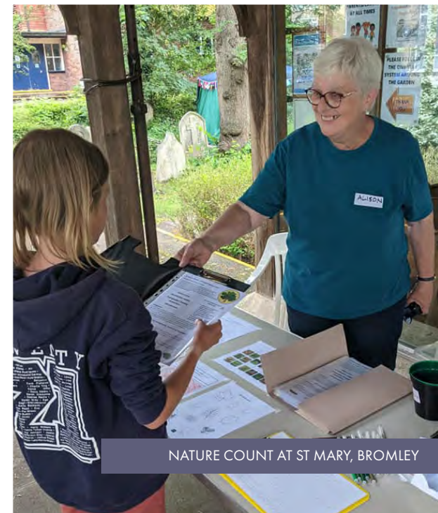
NATURE COUNT AT ST MARY, BROMLEY