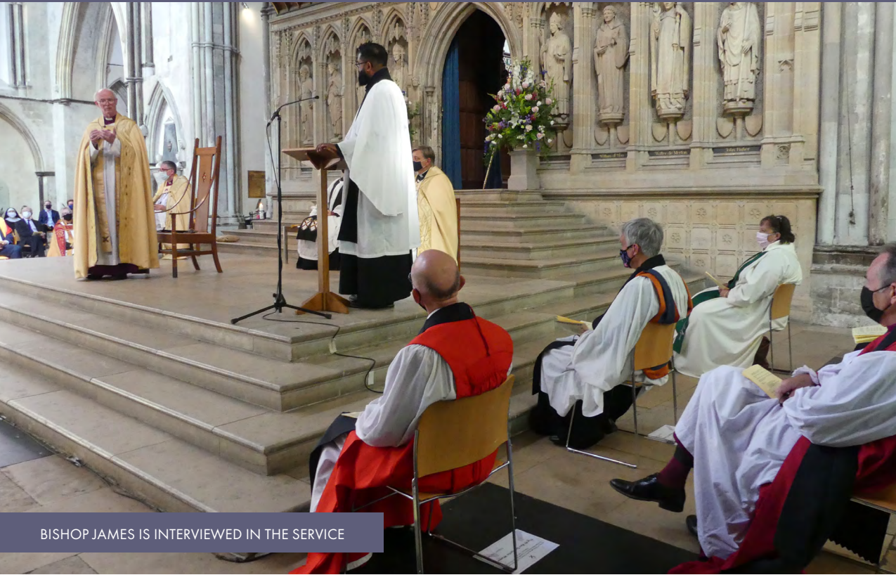
BISHOP JAMES IS INTERVIEWED IN THE SERVICE