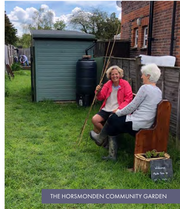
THE HORSMONDEN COMMUNITY GARDEN

Over at The Holy Redeemer in Lamorbey, forty-seven different species of wildlife were recorded. St Mary, Bromley's garden church also got involved with the count, after a rousing chorus (outside) of 'All things bright and beautiful' of course!