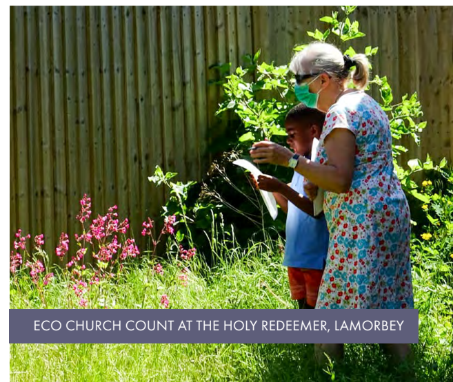
ECO CHURCH COUNT AT THE HOLY REDEEMER, LAMORBEY